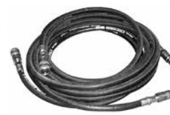
ADDITIONAL ITEM REQUIRED: 372-02