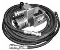
ADDITIONAL ITEM REQUIRED: 372-05