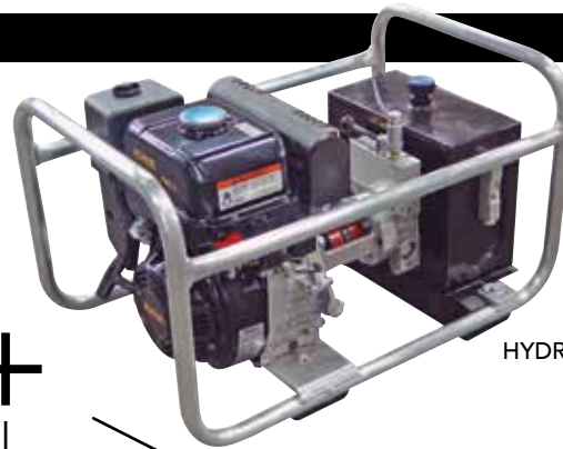
HYDRAULIC POWER UNIT 372-01