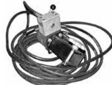
ADDITIONAL ITEM REQUIRED: 372-351-05