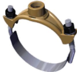
STYLE 101BS BRONZE SADDLE WITH STAINLESS STRAP