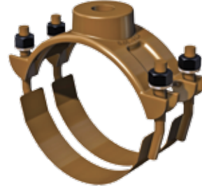
STYLE 202B BRONZE SADDLE WITH BRONZE STRAPS