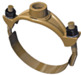
STYLE 101B BRONZE SADDLE WITH BRONZE STRAP