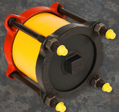
EC501 4" - 16" sizes