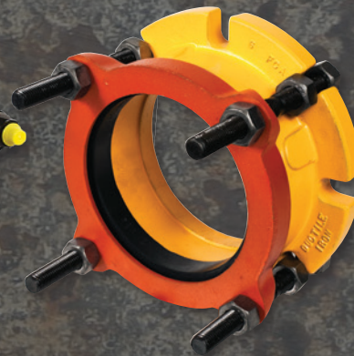
FCA501 Sizes from 3" - 16"