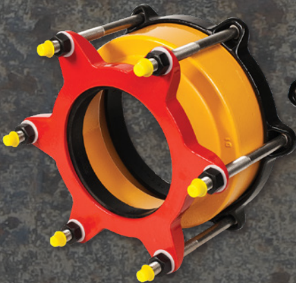
RC501 3" - 24" sizes

The FIRST DI Coupling with color-coded interchangeable parts