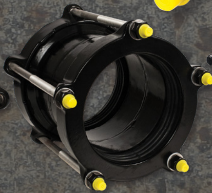
XR501 Sizes from 4" - 12"