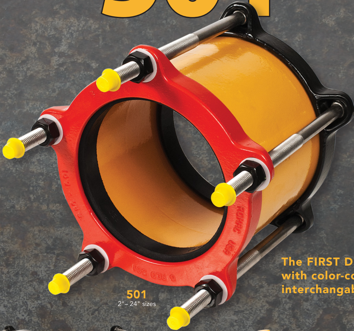
501 2" - 24" sizes

The FIRST DI Coupling with color-coded interchangeable parts