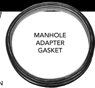
MANHOLE ADAPTER GASKET