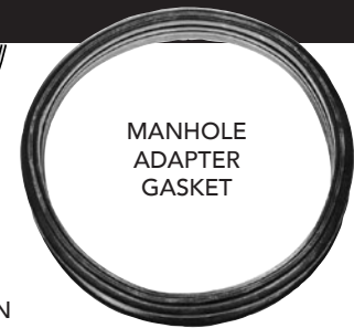
MANHOLE ADAPTER GASKET