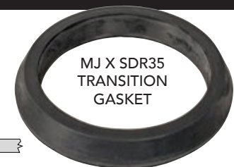
MJ X SDR35 TRANSITION GASKET