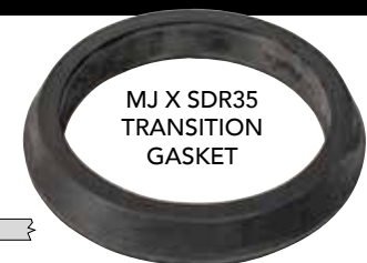
MJ X SDR35 TRANSITION GASKET