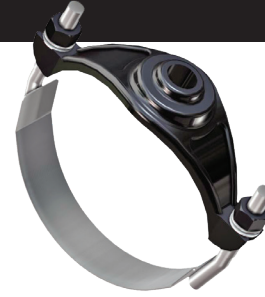
STYLE 101N-H NYLON SADDLE WITH STAINLESS STEEL SINGLE STRAP