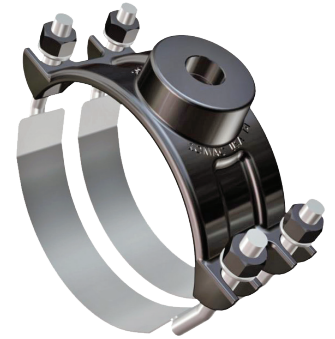
STYLE 202N-H NYLON SADDLE WITH STAINLESS STEEL DOUBLE STRAP

For above-ground HDPE applications, contact Romac's Engineering Department at 1-800-426-9341.