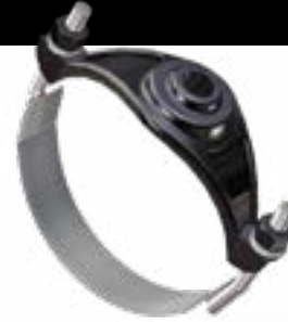
STYLE 101N-H NYLON SADDLE WITH STAINLESS STEEL SINGLE STRAP