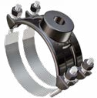
STYLE 202N-H NYLON SADDLE WITH STAINLESS STEEL DOUBLE STRAP

For above-ground HDPE applications, contact Romac's Engineering Department at 1-800-426-9341.